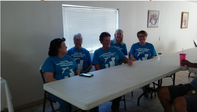
Part of our crew